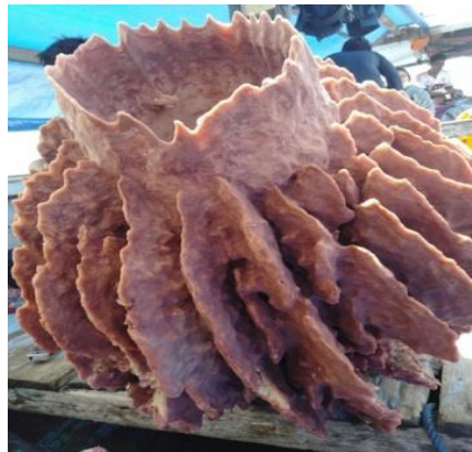
Figure 3. Sponge Xestospongia testudinaria from Spermonde Archipelago, Indonesia

X. testudinaria is found in the lagoon reef area, in front and behind the reef with a depth of 5-15 meters. The color of the sponge is peacock brown. The sponge is shaped like an upright cup which has been described as a volcanic sponge with a pattern of vertical worms or ridges on its outer surface. The ridge may be highly prominent and extend at right angles to 5 cm from the surface or more flat and form a rounded knob-like shape. The texture of the sponge body is hard, springy, the body tissue is very compact and is interspersed with channels with a diameter of 0,5 (Fromont, 1990; Hatami et al. , 2022).