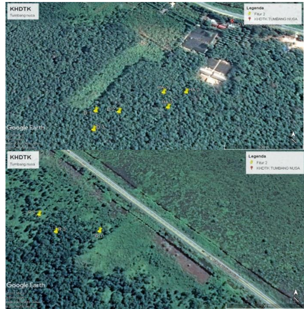
Figure 1. Sampling Map

different size, namely 50 cm, 100 cm, 150 cm, 200 cm, and 250 cm.